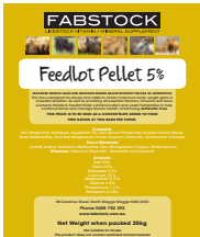
Feedlot 5% Pellet

Happy Feet is a combination of our Lactation Pasture Mix with added Zinc and Biotin. This lick has been extremely popular in the prevention of foot abscess and scald during the wetter winter months.